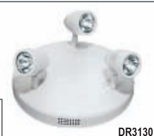
Lamps: MR16 halogen, 6, 12 and 24 volt