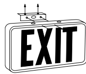
Ceiling mount (flush ceiling)